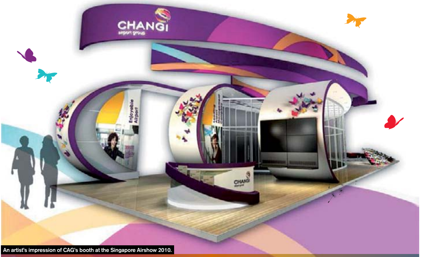
An artist's impression of CAG's booth at the Singapore Airshow 2010.

For the first time, Changi Airport Group (CAG) is participating at Singapore Airshow 2010, Asia's biggest aerospace and defence exhibition, and one of the world's top three aviation events. Occupying 208 sqm, the CAG booth features a walk-through garden featuring a variety of flowers and plants. In the glass enclosure, there will also be 200 to 300 butterflies of various species, providing visitors with an up-close experience, not unlike that provided by the Butterfly Garden at Changi's Terminal 3. Outside the garden, on-screen displays highlight new and popular features of Changi Airport, interesting facts about Changi's connectivity, the major attractions coming up in Singapore and a profile of CAG as a leading airport management company.