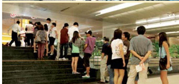
A crowd puller, Swensen's at Terminal 2 attracts crowds, especially on weekends and public holidays

Swensen's has been very much part and parcel of Changi Airport's history, opening its first restaurant at Terminal 1 in 1981, the year the airport started operations. The American casual dining concept restaurant relocated to its present location at Terminal 2's Arrival Level in 2005. Last year, Earle Swensen's, another restaurant concept under the Swensen's stable, opened at Terminal 3.